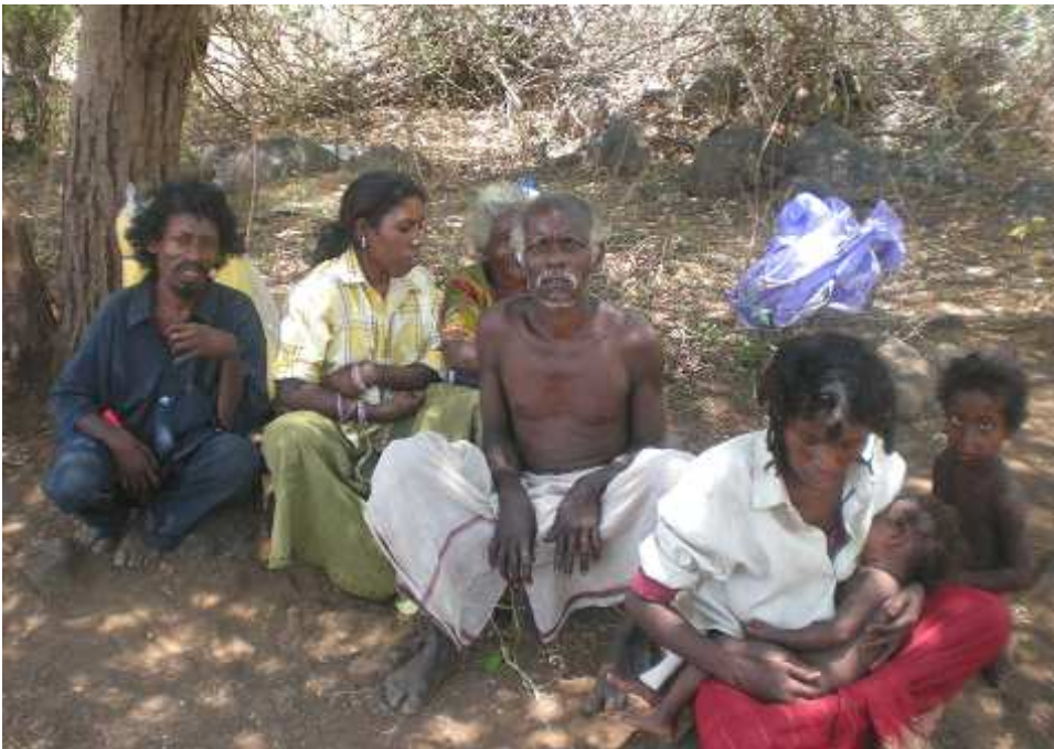
Just retrieved tribe families from Caves and to be rehabilitated by ROSI FOUNDATION