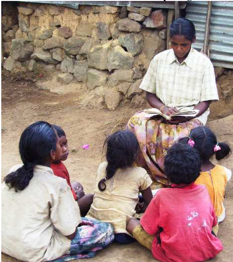
Tribe children under non-formal education by ROSI Foundation