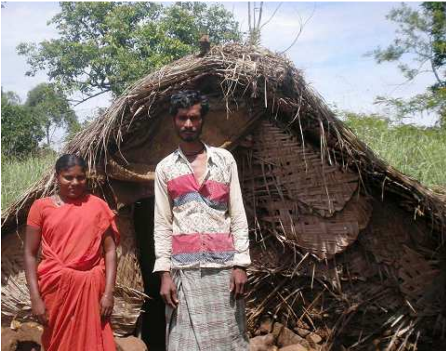
The another one retrieved family is provided by a temporary house in the above land