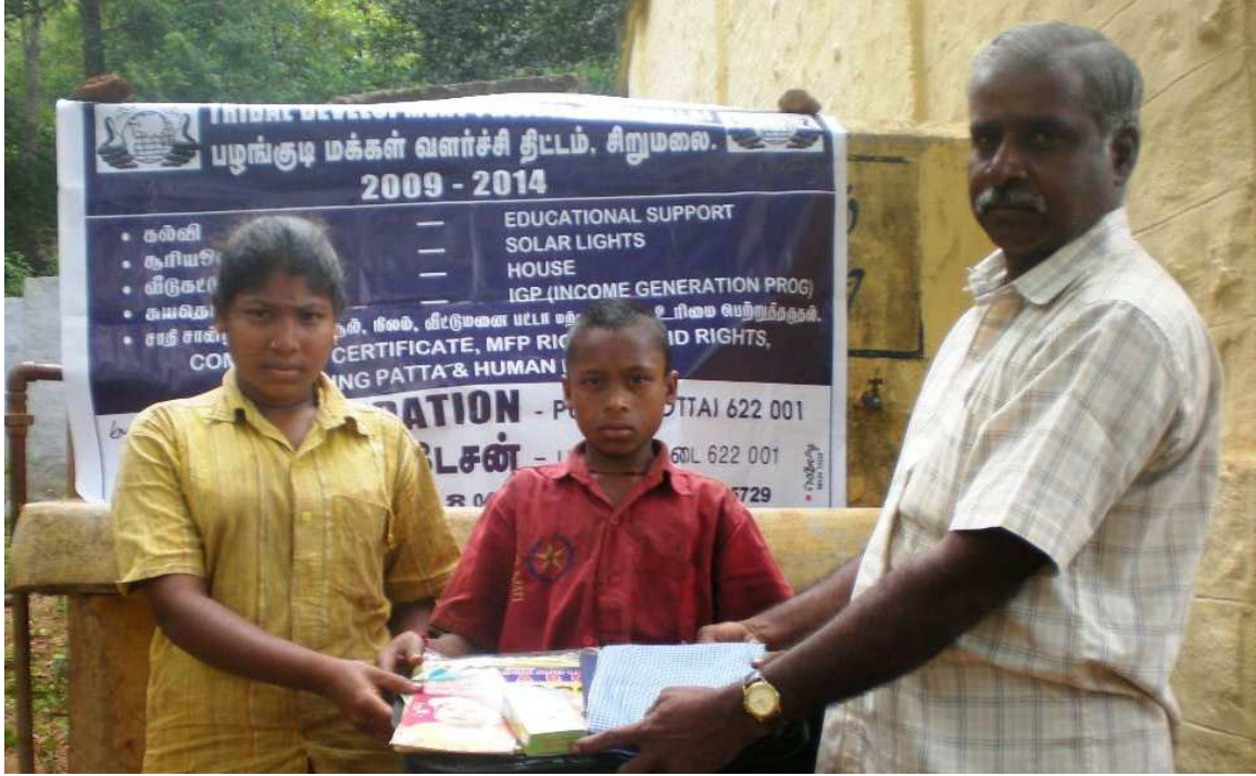
Educational materials and uniform distribution to tribe children