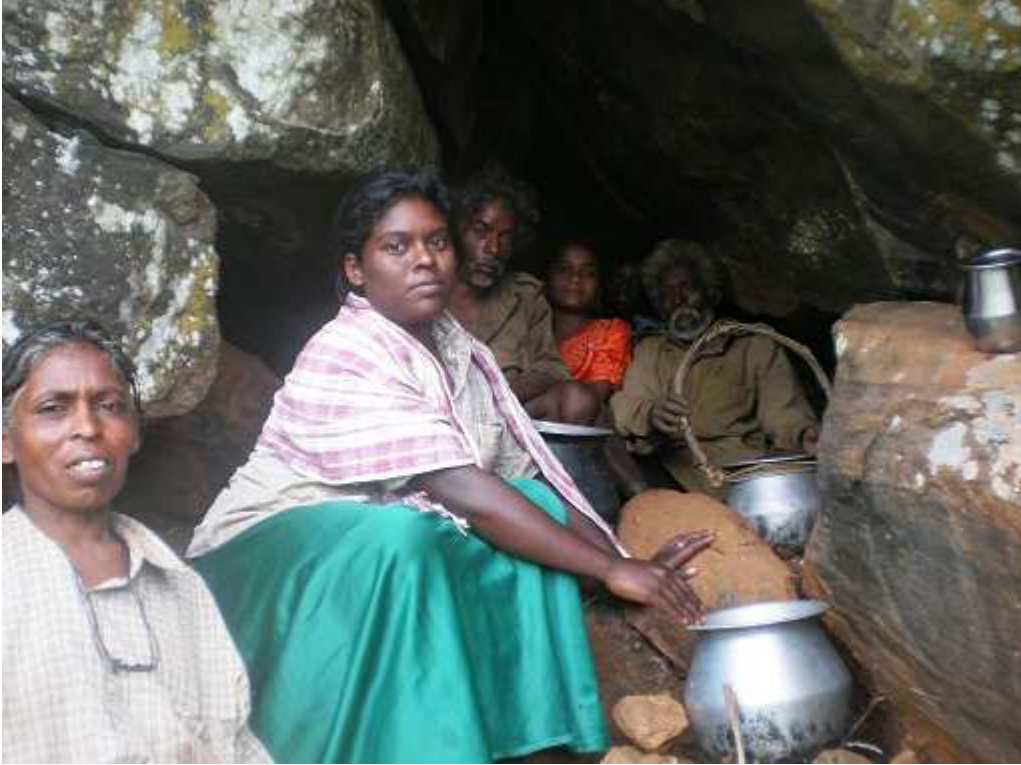
Still in to cave