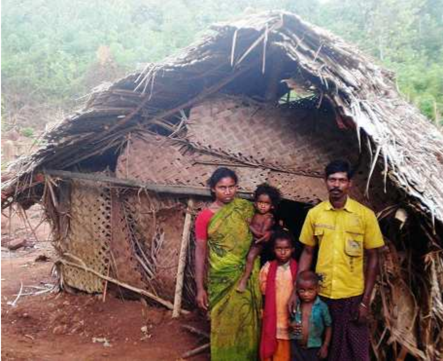
The one retrieved family is provided by a temporary house in the above land