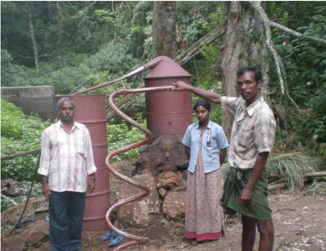
Another one IGP unit functioning in production