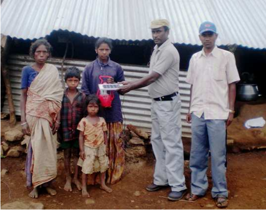
Solar light support to tribes