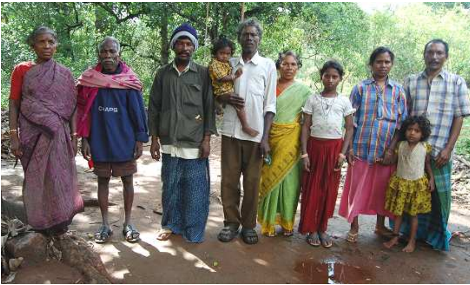
Some of the affected tribe families

Now the case was registered under SC/ST atrocities act and the accused are under arrest 21.01.2010. Further process is ongoing.