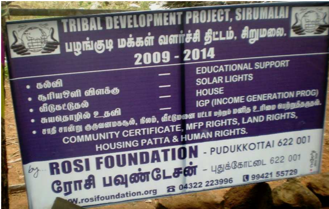
A BANNER/BOARD DETAILING THE ROSI PROJECT FOR TRIBE PEOPLE