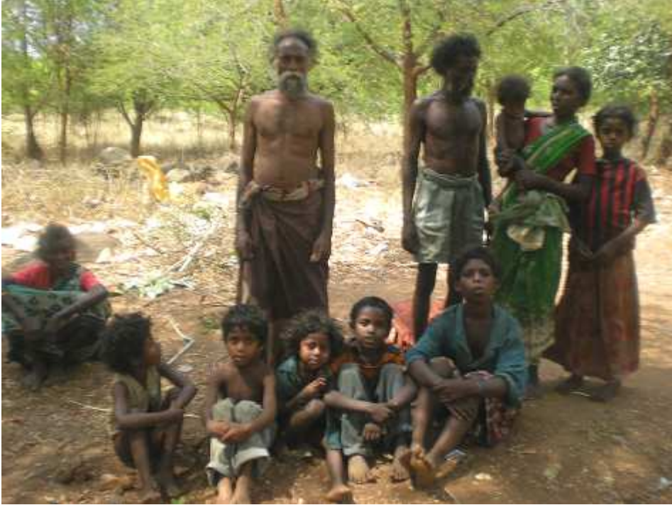
Just retrieved tribe families from Caves and to be rehabilitated by ROSI FOUNDATION