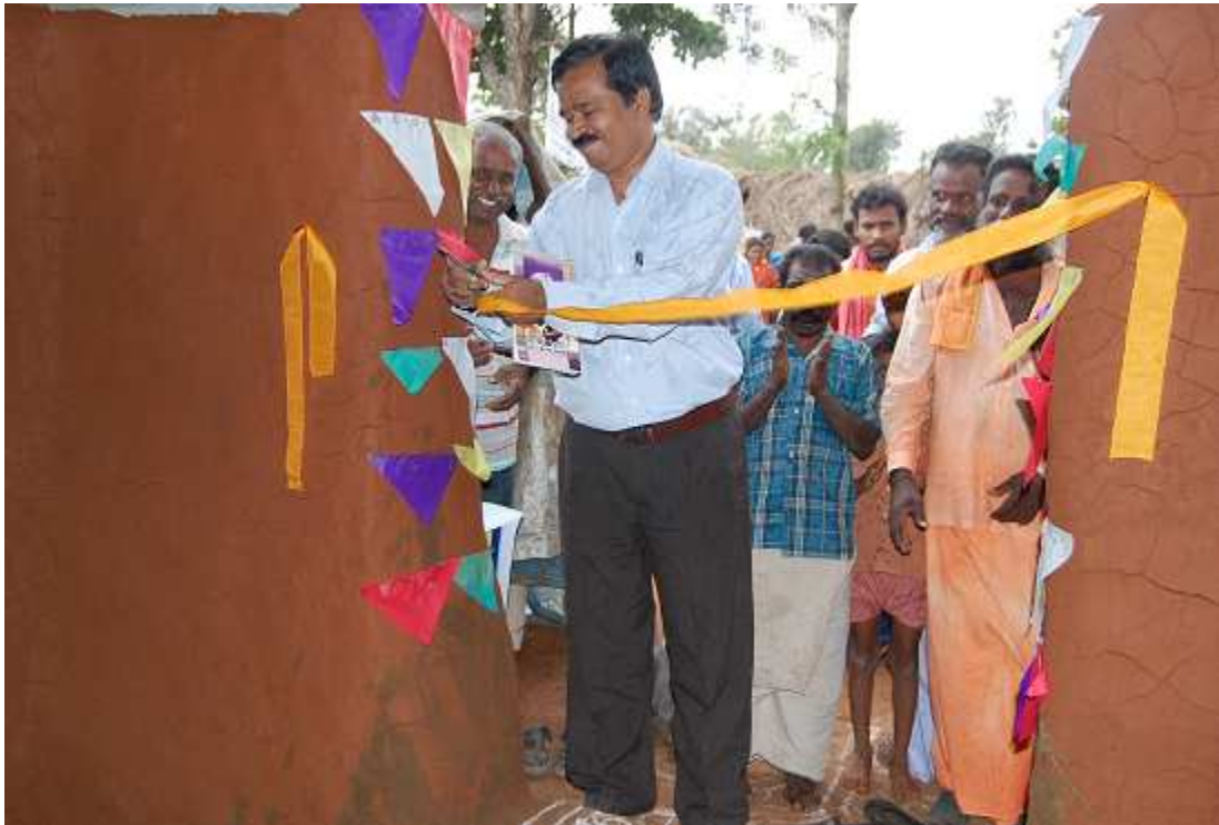
ROSI's educational centre opening to tribe children