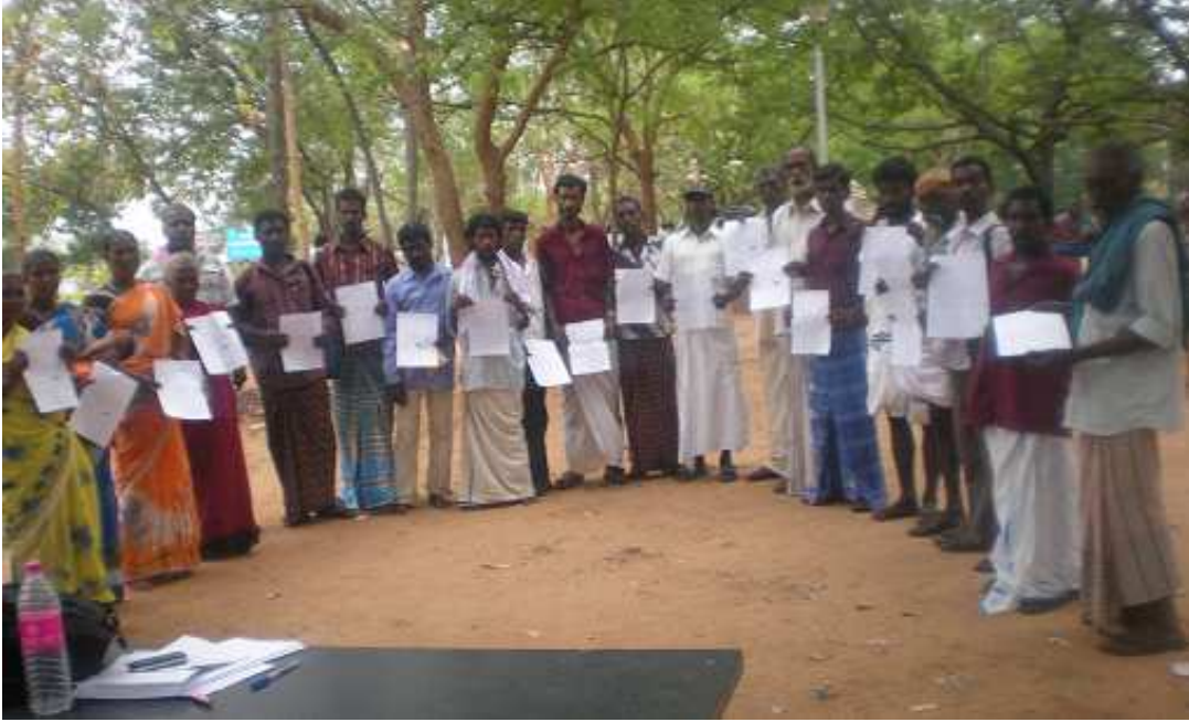
ROSI Foundation takes Some tribes with petition seeking house patta and community certificate to dist collector