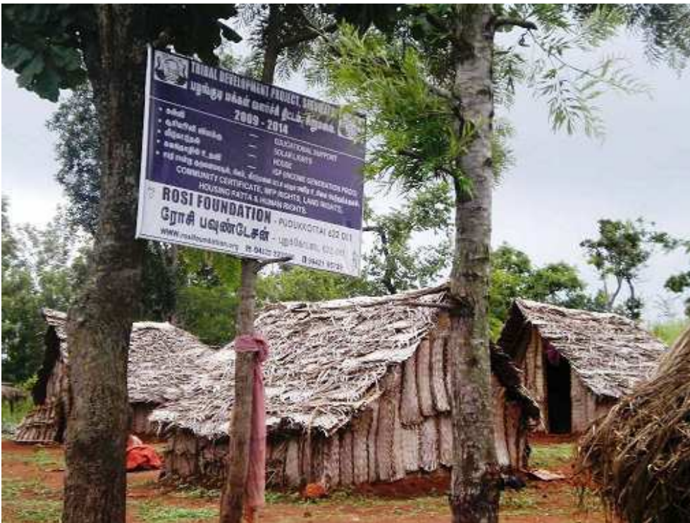
ROSI's made huts for the homeless tribe in the above 5 acres lands