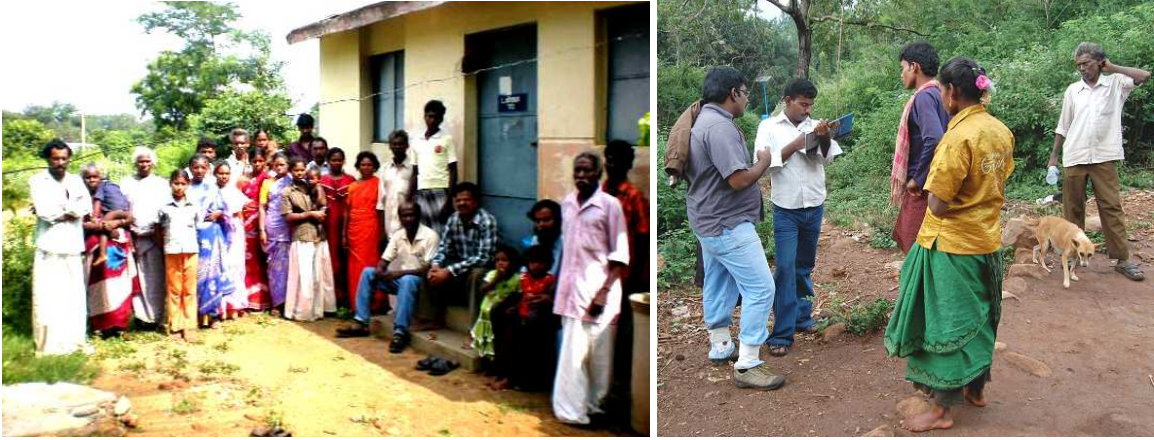
ROSI's Fact Finding team with the affected tribe