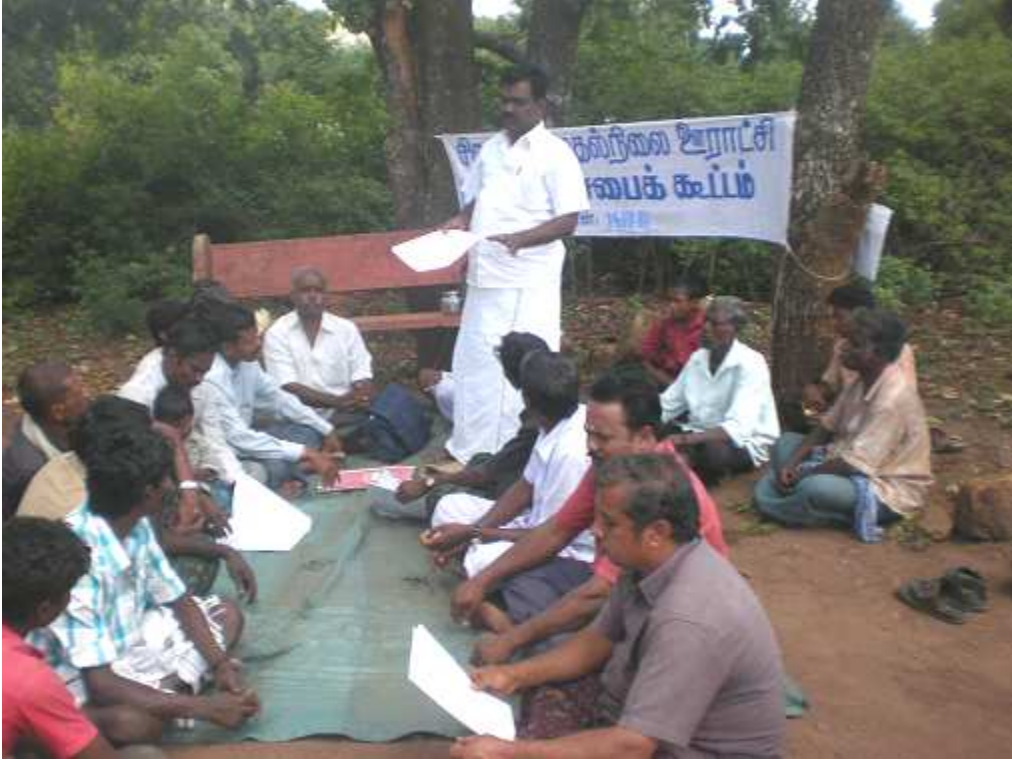
ROSI's representative fights for tribe in Local Body – village committee meeting