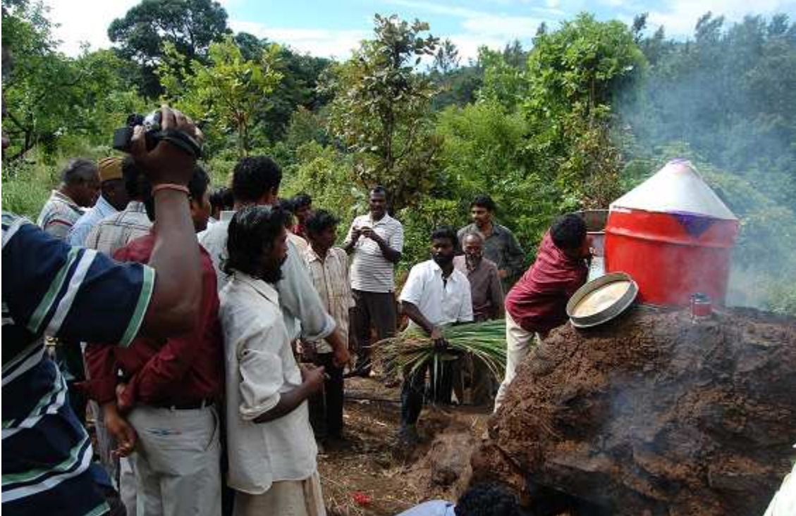
IGP unit opening (Lemon grass essence extraction) to tribe families by ROSI Foundation